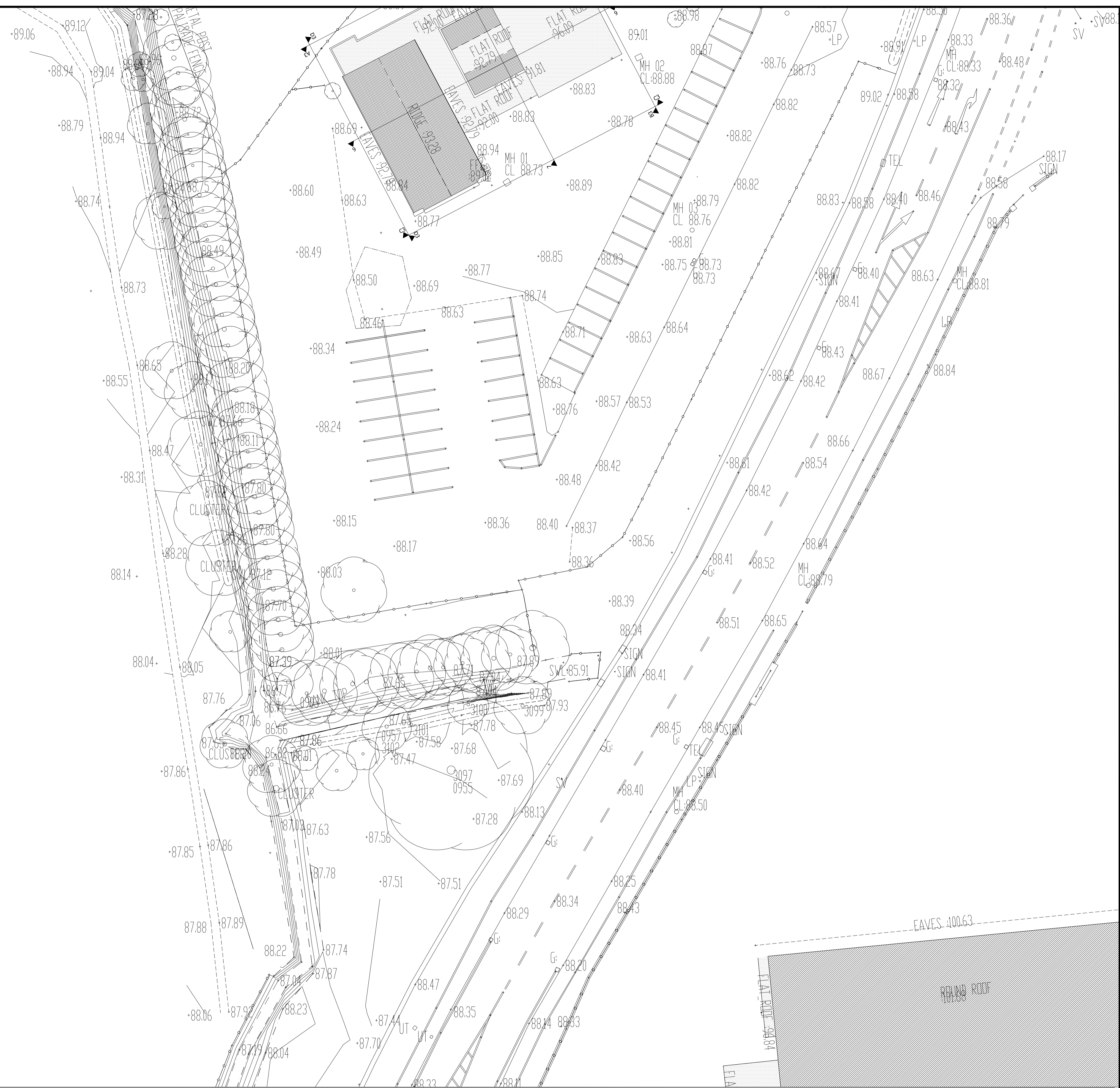
Topographical Survey Scale 1:250